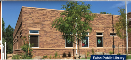
Eaton Public Library