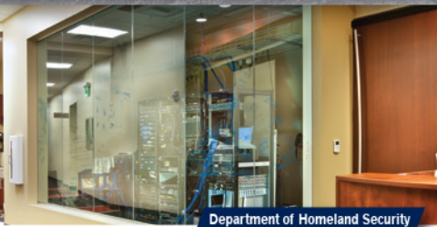
Department of Homeland Security